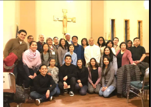
(BLD's annual Washing of the Feet Retreat was held on February 23, 2019 at St. Thomas Church, Old Bridge. Above is a reflection by one of the participants.)

"Unless I wash you, you will have no inheritance with me." -Jn 13:8